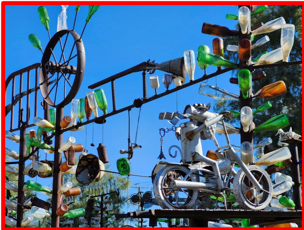
Oro Grande Bottle Ranch, CA.

Have you checked out the Chapter "A" Website lately? Our Webmaster works on it almost daily, Check it out!