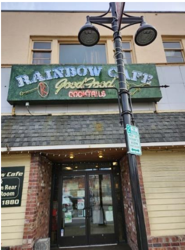
Front Entrance to Rainbow Cafe